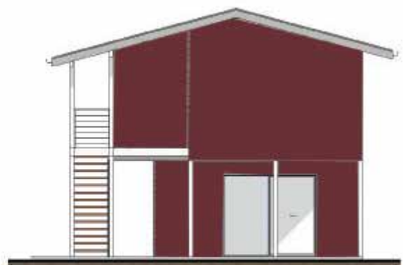
side 2 elevation